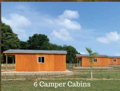
6 Camper Cabins