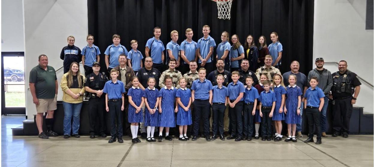
The Sheriff's Office along with the local police departments were invited to eat lunch and play games with the students of One School Global!