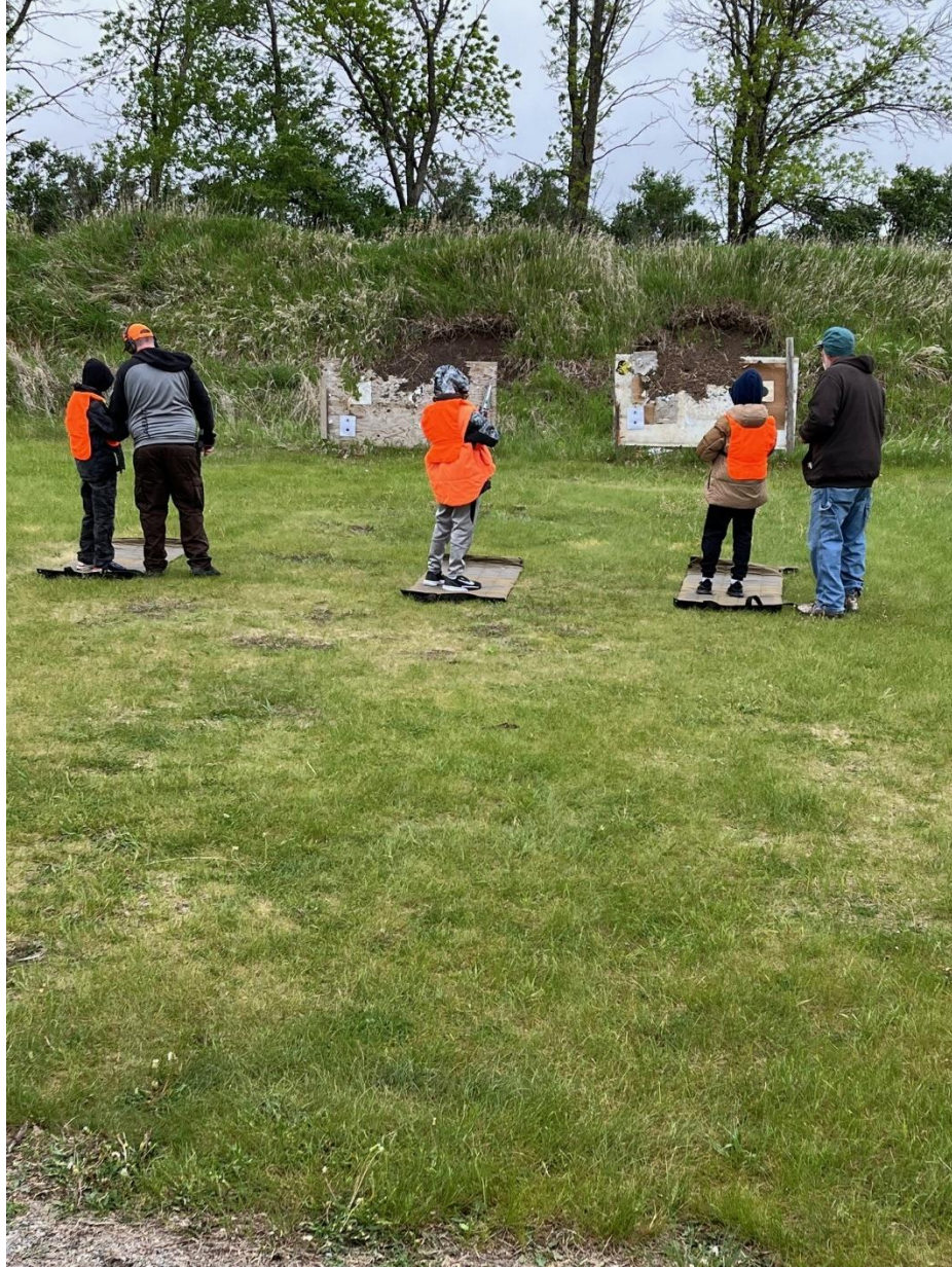
Redwood County Sheriff's Office helping at the firearms safety course.