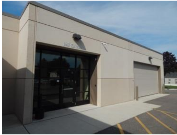
(Main Entrance to the Redwood County Jail)