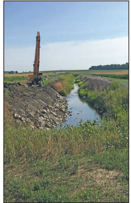
Repair work has begun, but sloughing ditch banks can be seen past the excavator.

Please be patient as we mobilize and complete all the necessary repairs. Some repairs have been on hold since the day of the event to ensure that we secured