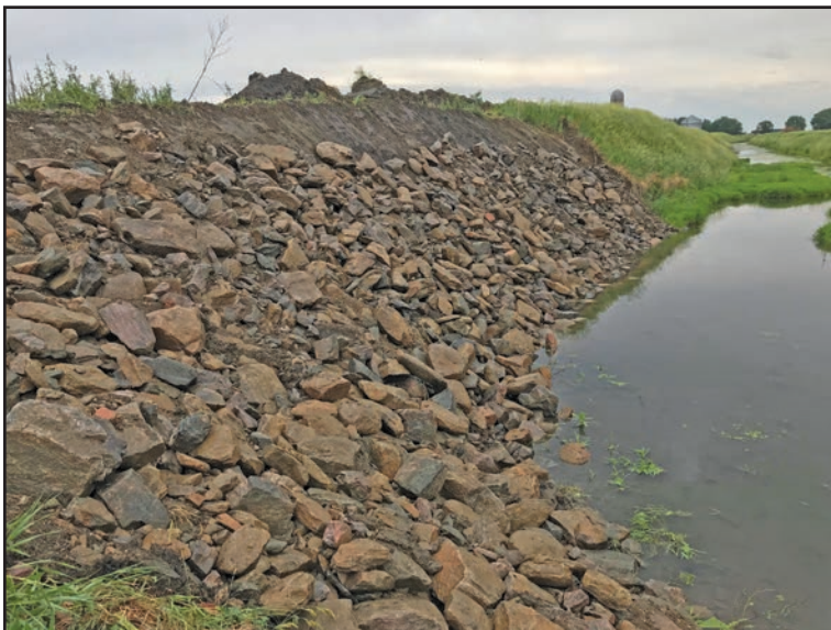
Example of a completed rip-rap job on an outside curve of a ditch bank.

FEMA assistance dollars to complete them. Most repairs are simply just waiting in the docket as we work through the thousands of repair locations and complete them in the most cost-effective manner. If you have any questions, please contact the Environmental Office at (507) 637-4023, or at Environmental@co.redwood.mn.us .