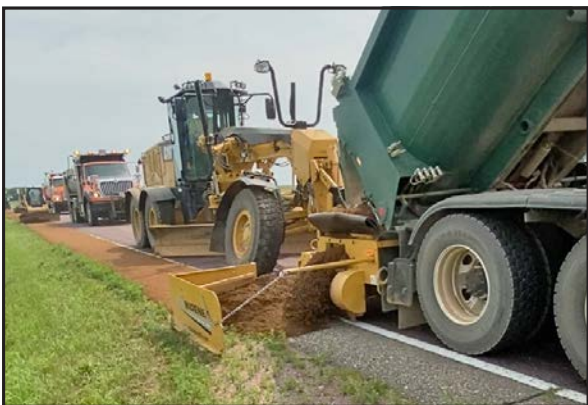
Redwood County Highway Department crews re-gravelling shoulders in August 2021

All of the work completed this year has been possible due to the diligent work of our small 24 person team at the highway department. Every single employee makes substantial contributions on a daily basis, whether it be hauling gravel, patching roadways, installing signs, repairing equipment, Accounting work or planning and inspecting construction projects. As the County Highway Engineer, I constantly remain impressed by the level of talent, dedication, ingenuity and professionalism that our team exhibits. If you ever have a question regarding our work at the highway department, please do not hesitate to call our office at (507) 637-4056.