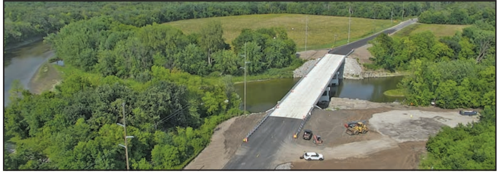
CSAH 101 MN River Bridge on September 2, 2021

Our maintenance crews have installed over 40,000 tons of gravel on roadway surfaces and shoulders, almost double than a typical year. Our efforts were primarily focused in the south-west portions of Redwood County. We intend to focus re-graveling efforts in the south-east portion of Redwood County in 2022, and in the north half of Redwood County in 2023. Additional work completed this summer has included crack filling, pot-hole patching, ditch and bridge mowing, tree removal and various erosion control projects alongside our roads and bridges. Our team will begin preparing for winter in October by mixing salt and sand and hauling to various shop locations.