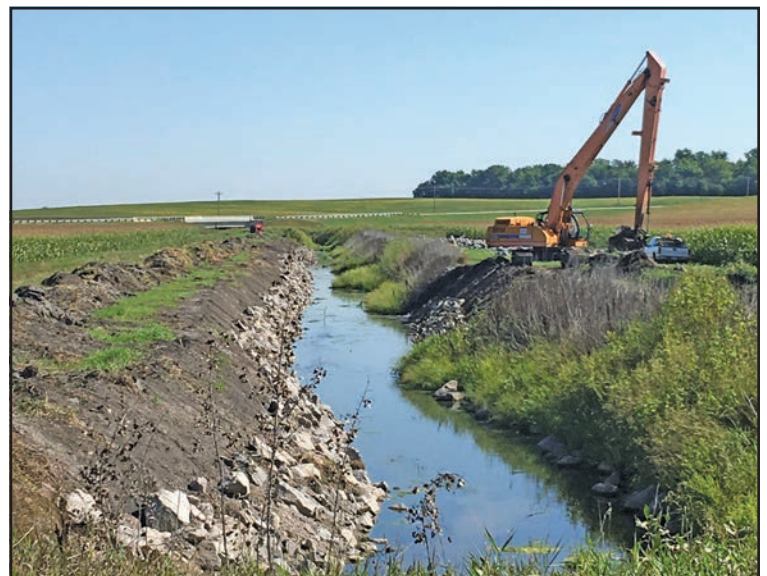
Repair work completed on the left side of the ditch bank. Material has been removed from the ditch and the banks have been hard armored.