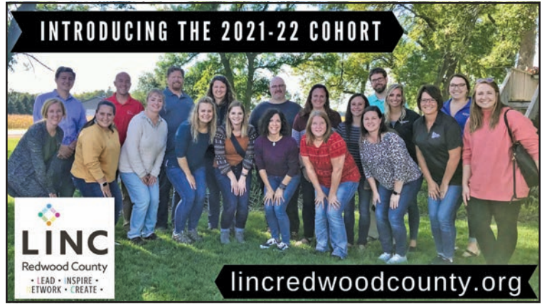
The Redwood County EDA is a financial supporter of LINC Redwood County

The Environmental Office staff are happy to answer your questions and assist you in the permitting process so you can be ready to go as soon as the weather clears and the ground is dry. Stop in the Environmental Office or call (507) 637-4023 to get ahead of the Spring rush.